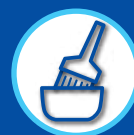
Dyes & Pigments