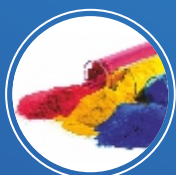
Dyes & Pigments